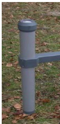
LEMI-039D X gradiometer