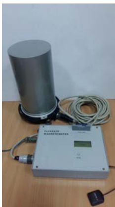
LEMI-039D X observatory

Option n- WAB: LEMI-039D X with web access box