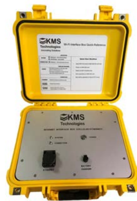
KMS web access box

Please contact info@KMSTechnologies.com or sales@LEMIensors.com for more information and get your quote today!